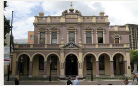
Parramatta's historic town hall will be integrated into Civic Place.

Although most buildings will be demolished, historic buildings inside the Civic Place footprint will be integrated into the redevelopment, contributing to a mix of old and new. Significant high rise buildings will be set back to avoid overpowering the modest scale of the historic Parramatta Town Hall, St Johns Anglican Church and Leigh Memorial Uniting Church. The attractive frontage of shops on the Mall at the corner of Macquarie Street will also remain.