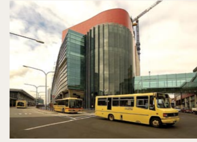
Parramatta Transport Interchange.

Parramatta's transformation is already well underway, with the recent completion of the transport interchange and partial reopening of Church Street Mall. Major new City buildings include offices for the Commonwealth Bank and Children's Court, with the staged relocation of the Attorney-Generals Department to the Parramatta Justice Precinct to be completed in 2008. They join other government offices that have already relocated from the Sydney CBD.