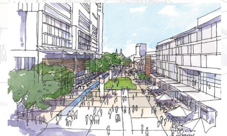
Civic Place artist's impression by Tim Throsby. (Cities Taskforce in association with Parramatta City Council.)

The information and illustrations in this document are indicative only and subject to change. Council does not warrant the accuracy of the information or illustrations and does not accept any liability for any error or discrepancy in that information. This document does not create a legal relationship between Council and any other person and does not constitute an offer to sell or lease.