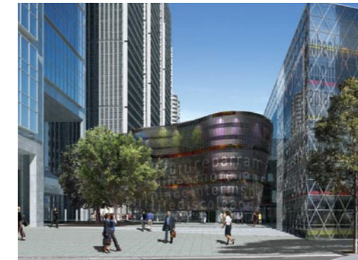
Artist's impression of public art gallery and office blocks looking east.

For residents juggling work, family and school homework, the transformed Civic Place will deliver new community facilities including a new library, childcare centre and community rooms. These will be linked to Council's new administration offices and Chambers replacing the current 30 Darcy Street building and existing Council Chambers in 2012. Doing business with Council in person will continue to be just a short walk from the transport interchange.