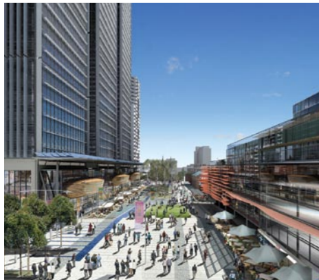
Civic Place artist's impression looking west to St Johns Cathedral.

The project will create over 8800 extra jobs, with a quarter located outside the CBD. A range of retail outlets will be encouraged to relocate to Civic Place, including premium food, fashion, leisure and lifestyle outlets. Also planned is Western Sydney's first independent cinema complex, and a market hall. Linking the new buildings will be a series of outdoor public spaces, each with its own distinctive character. Outdoor seating areas and places to meet, relax, stroll and enjoy the sunshine will make Civic Place not just a great place to work, but a destination in which to eat out, shop, catch an exhibition or an art house movie before and after work.