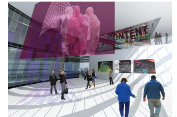
Artist's impression of inside spaces of public art gallery.

At the heart of Civic Place will be a cutting edge cultural precinct. Parramatta's first public art gallery linking the new library and heritage centre will be the centrepiece of Council's new community facilities. The gallery will focus on new media arts (moving images, photography, sculpture, installations and sound) and is expected to draw visitors from across Sydney. An adjacent centre showcasing new technology and media will encourage community interaction via digital storytelling, video conferencing, virtual reality and on-line demonstrations.