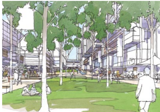
Civic Place artist's impression by Tim Throsby. (Cities Taskforce in association with Parramatta City Council.)

All buildings will be part of an integrated and aesthetic design for the entire city block. As required under the City's new planning guidelines, design competitions will be held for each major building. A minimum of three leading architectural firms will be invited to make submissions on each site. These firms will be selected by a design competition jury based on design excellence, sustainability principles and practice, experience in the proposed building type and capacity to complete the commission.